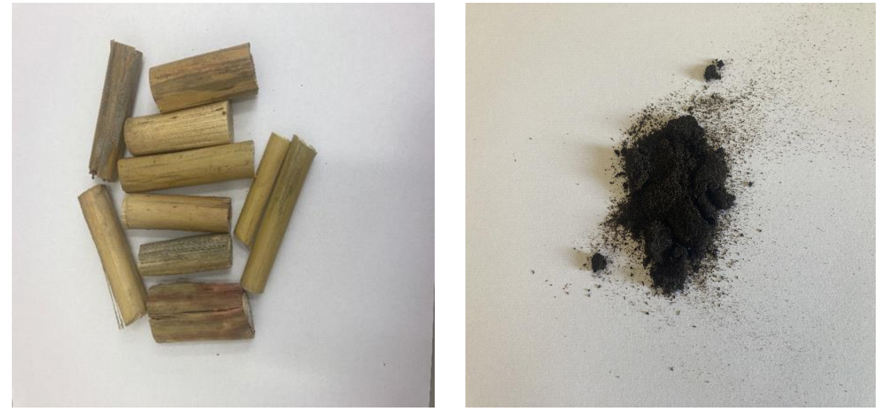
Figure 3. Milet stalk before and after torrefaction

Table 3 prestents the mass yield (Y_{mass}) , energy yield (Y_{energy}) and energy density (E_d) of torrefied biomass compared to agricultural and food waste.