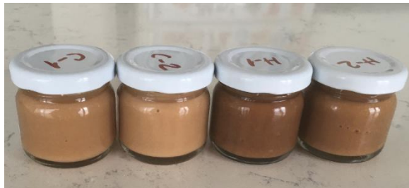
Figure 2. Photograph of produced DL samples (C1, C2, H1 and H2 samples in order from left to right).

In the Maillard reaction, some degradation products have been formed depending on the temperature and pH of food. In neutral or acidic foods, while if the initial sugar is pentose, furfurals form; if hexose, the formation of HMF takes place. In alkaline foods, it consists of reductones and fission products such as acetol, pruvaldehyde, and diacetyl. All these released Maillard reaction products are very reactive and play an important role in the next steps (Villamiel et al., 2006). Because of the reactivity of HMF, it can easily transform into other compounds. Moreover, this might be due to fact that HMF was not only formed from the Amadori compound but also from sugars (Yuksel, 2014). HMF formation in lactose non-hydrolyzed DL samples (C1 and C2) may be due to lactose isomerization and degradation. The reason why HMF could not be detected in the H2 sample. It may be due to HMF being reactive and converting to other compound or compounds in the next step. In this context, both the hydrolysis of lactose and the lower sugar content in the H2 sample may be among the effects that accelerate the progress of the reaction.