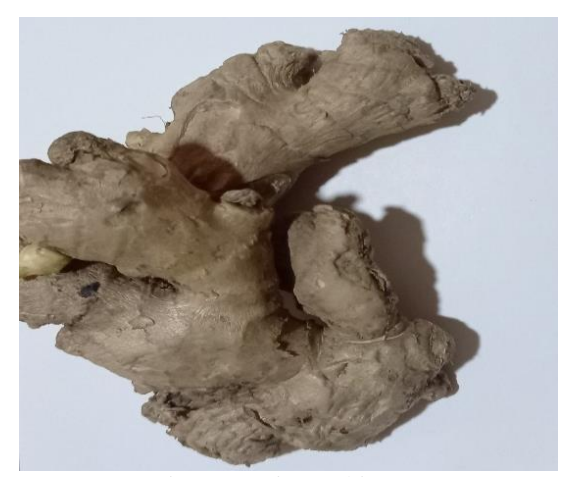
Figure 1. Ginger rhizome

Ginger (Zingiber officinale Roscoe), one of the most widely known perennial herbs, is derived from the underground stems or rhizomes of the plant (Sharifi-Rad et al., 2017). It is widely used as a spice and flavoring agent around the world and also medicinally (Ogodo and Abia, 2013; Sharifi-Rad et al., 2017). Additionally, Zingiberaceae species have been reported to have oils and alkaloids that possess antimicrobial, anti-parasitic, immune booster, antioxidant and other important biological properties. Now extensively employed in the management of different infections, ginger rhizome can be in the form of fresh paste, ginger tea (flavoring), dried powder or preserved slices (El-Ghorab et al., 2010) and also incorporated into many commercial products. It is most especially, a go-to product for sore throat, cough and some other upper respiratory tract infections, so, in vitro antimicrobial activity against two predominant pneumococcal agents, S pneumonia and H influenza was aimed at. Furthermore, analysis of inherent bioactive compounds using GC-MS would give an insight into the numerous bioactive compounds responsible for some of the earlier mentioned medicinal properties.