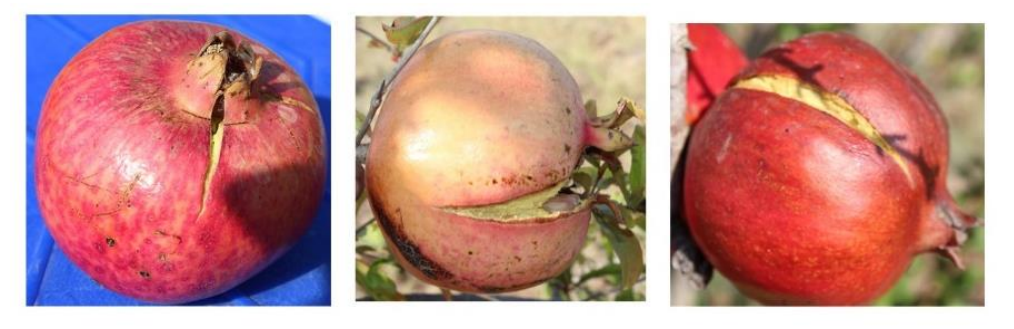
Figure 1. Some fruits with cracking