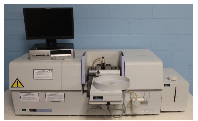
Figure 1. Atomic Absorption Spectrophotometer