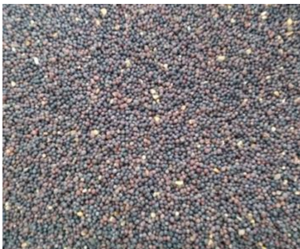
Figure 2 Wild mustard ( Sinapis arvensis L.) seeds