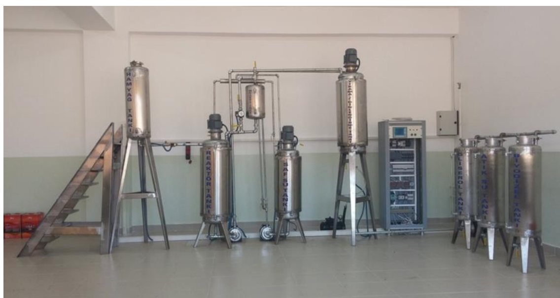
Figure 5 A small scale pilot biodiesel production plant