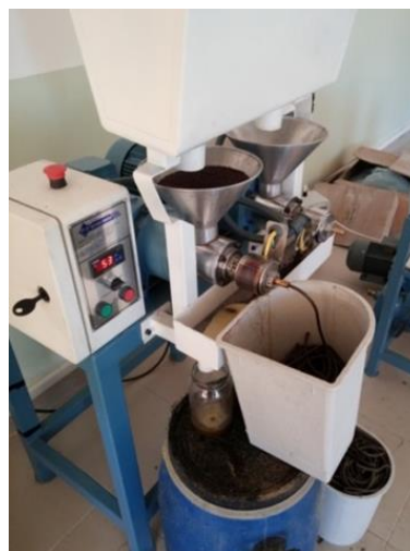
Figure 3 A screw press