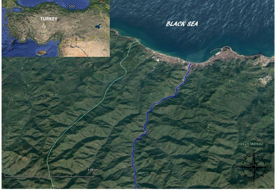
Figure 1 The Study Area (Batlama Creek, adapted from Google Earth)